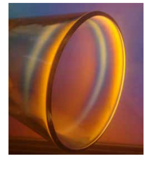
RIM tempering solution

Vidromecanica's Rim Tempering treatment, is a heating process with quick cooling, which is strengthening the glass just only on the upper third of the glass, and putting some less stress on the glass, if we compare with fully glass tempering. The end edge of glass, rim, is more resistant with longer life and the glass articles will have added value for the customers.